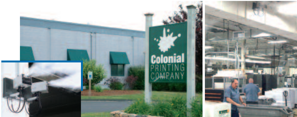
DRAABE TurboFog 16