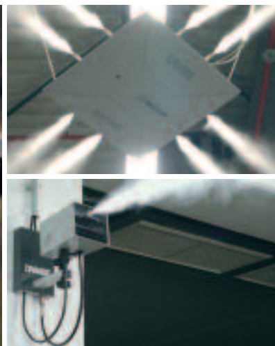
DRAABE TurboFog 4 and TurboFog 32

Reinforced by over 20 years of experience, Apex Graphics is the leading Canadian supplier of precision-folded, package inserts and outserts. A new air humidification system has increased productivity significantly.