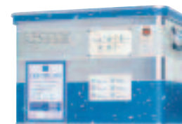
Portable DRAABE containers are simply exchanged for servicing

systems, two DRAABE TurboFog 32 high-pressure humidifier and three TurboFog 4 units were installed in the pressroom and bindery. "DRAABE offered a clean, efficient and maintenance-free solution. Furthermore the system is expandable, which allows it to grow with us and not be a fixed investment," says Sean Magill. The flexibility with which the different TurboFog atomizers can be combined together guarantees optimum humidity for each individual room requirement. With only one high-pressure circuit, the complete system costs very little to buy and to operate.