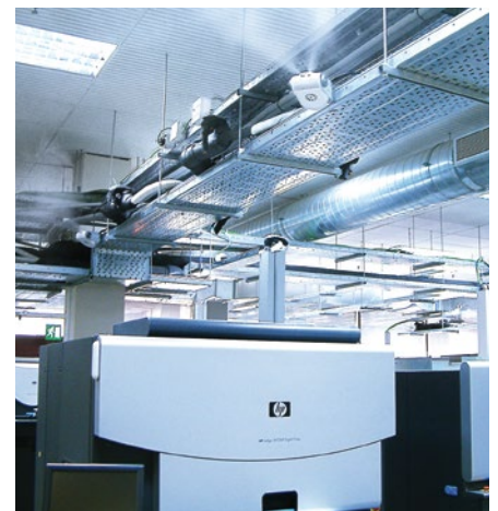
Optimum humidity protects digital printing systems from electrostatics

Condair Systems GmbH Nordportbogen 5 22848 Norderstedt Germany Phone: +49 40 853277-0 Fax: +49 40 853277-44 E-Mail: info@condair-systems.eu Internet: www.condair-systems.eu