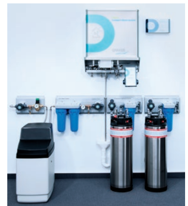
DRAABE TrePur Compact