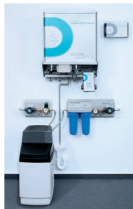
DRAABE DuoPur Compact