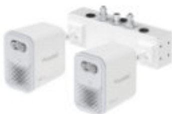
Wall mounting (for Vita Sky T or two heads)