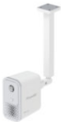
Simple ceiling mounting

Condair Vita Sky M and Vita Sky T are also available with 2 nozzles.