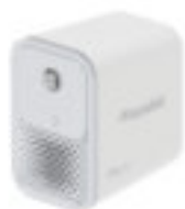
Vita Sky M1