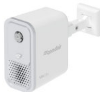
Simple wall mounting (for one head)