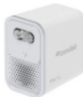
Vita Sky M2 (two nozzles)