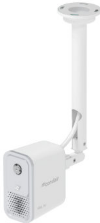
Premium ceiling mounting