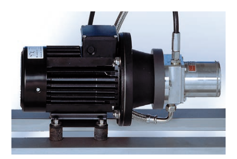
DRAABE MyFog high-pressure pump with oil-free action

The DRAABE MyFog high-pressure pump is manufactured from high-quality stainless steel. It works using water hydraulics and is therefore completely oil-free. This saves on maintenance and extends the product lifetime. We guarantee 5000 hours of operation maintenance-free for the high-pressure pumps in the first two years.